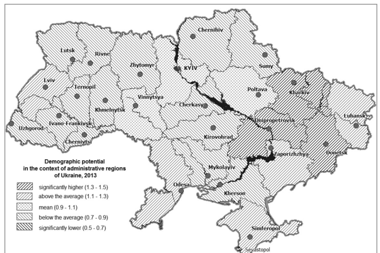
Fig. 2: Demographic potential of the regions of Ukraine, 2013

Demographic processes in the region are characterized by negative values with the positive trends: increased fertility (9.9%) and reducing of the mortality rate (14.5%). At the same