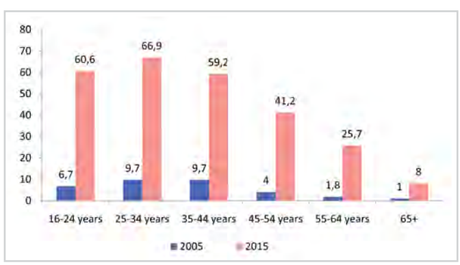
Fig. 1: Individuals shopping on-line in individual age groups (in %)

Figure 1 shows a dramatic change in on-line shopping since 2005. In all surveyed age groups there has been a sharp