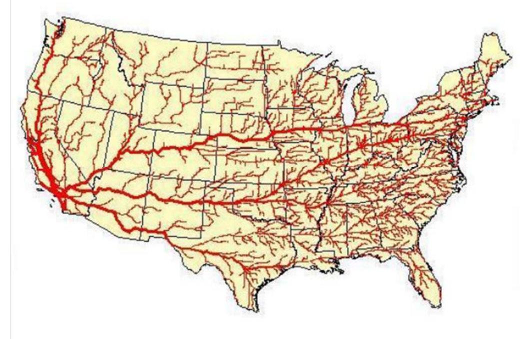
Fig. 4. National Intermodal Freight Flows to/from the Los Angeles Region

sage is the same — make better use of what we have" [10]. It shows more than big potential of Californians, but their strategic openness for changes.