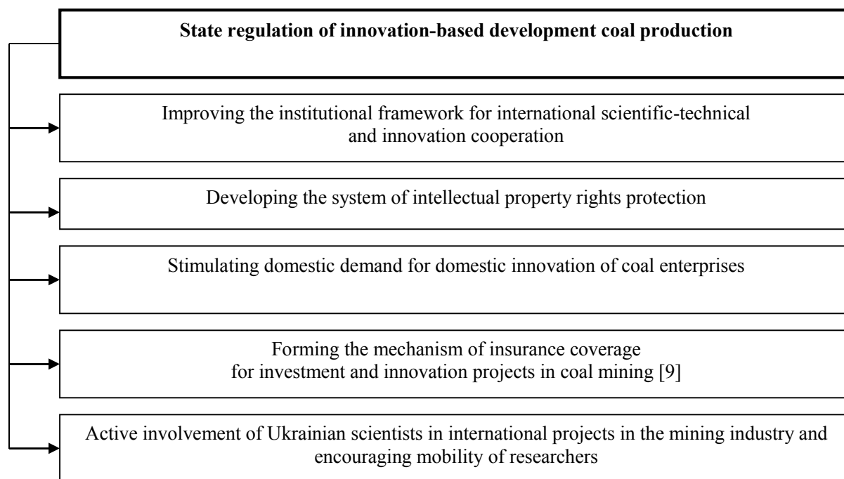
Fig. 2. Measures of state regulation of market mechanisms in the implementation of innovation-based development of the coal industry

able at the enterprise. It should be noted that to ensure that the assets are not destroyed, they have to earn the money at least on their own repair. In this sense, capitalization is a minimum condition that ensures a slow but progressive growth (development) of the company.