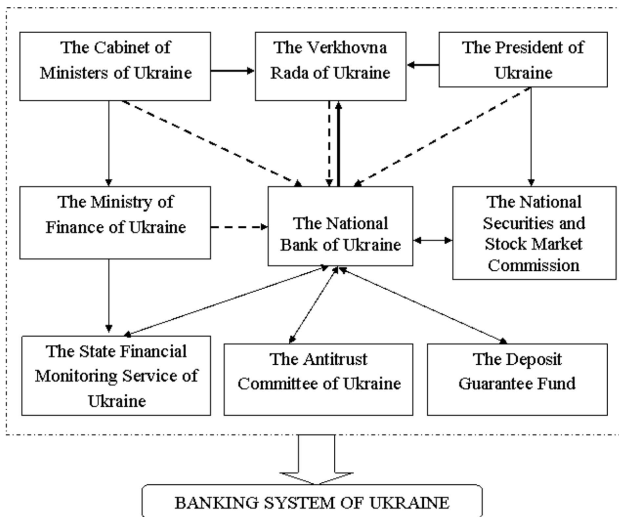
Fig. 1. The banking activity government regulation system in Ukraine.

Despite the significant number of government bodies, the National Bank of Ukraine is one and almost the single regulator in this sphere, and its links to other elements of this structure are considered “insignificant”. This approach to banking activity government regulation system formation is one of the most debatable in the modern theory and practice.