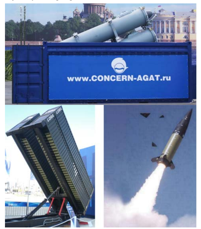
Fig. 4. Container-based launching units of missile complexes Club-K (above) and LORA (below)

into standard sea containers on ships near the coast line or even in ports (fig. 5) and capable of carrying nuclear charges over hundreds of kilometers while ascending to altitudes of several tens kilometers are the sources of HEMP invulnerable to any MDS both existing and potentially developed due to their capability of concealed approach to a target, ultra-low approach time and changing trajectory during flight.