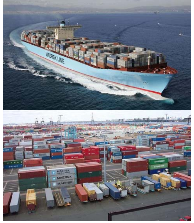
Fig. 5. Containers resting on ships and in ports where tactical ballistic nuclear warhead missiles can fit are invulnerable to MDS

then it could suddenly strike a rocket from a position which the enemy did not consider, which translates it from a tactical complex into strategical one.