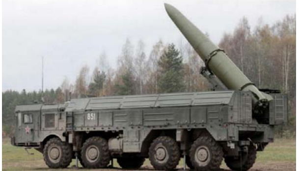
Fig. 3. Missile launchers of a battle-field support rocket SS-21 «Scarab B» (Tochka-U) – above and tactical ballistic missile system SS-26 «Stone» (Iskander-E) – below

The Club-K – Russian container-based missile unit, which can fit a standard 20- or 40-foot sea container, is intended for targeting above-water and ground targets. The unit can be installed on the coast lines, different classes of vessels, railway and truck platforms. The complex can be used with ground launching units as well as sea, railway and truck platforms. It can use the following anti-ship missiles: 3M-54KE, 3M-54KE1, X-35UE and missiles for hitting ground targets, such as 3M-14KE, X-35UE. All the missiles included in the complex are cruise missiles, flying at a relatively low altitude of 10-150 m and are not intended to be equipped with nuclear warheads, while LORA is equipped with tactical ballistic missile, which can fly as high as 45 km and can carry high capacity nuclear charges at a distance of up to 300 km.