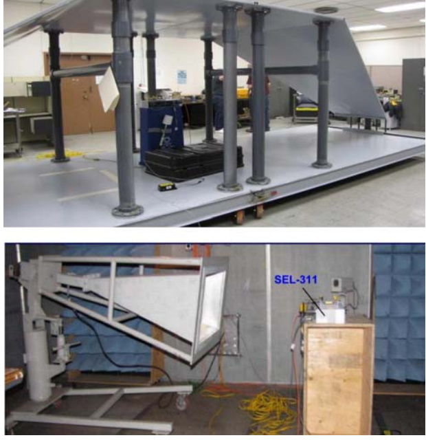
Fig. 2. SEL-311 DPR test for IDEI impact on Picatinny Arsenal test-benches in New Jersey [6]

Analysis of the result of the second independent trial of the same type of DPR. Another test of the same type of DPR (by an odd coincidence) is reported in a promotional presentation of the producer of these devices – Schweitzer Engineering Laboratories Company – SEL [6]. The presentation covers the results of testing of SEL-311 DPR samples on the test-benches of US Army's Picatinny Arsenal in New Jersey for HEMP and electromagnetic impact (fig. 2).