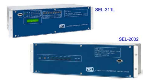
Fig. 1. SEL-311L DPR and SEL-2032 controller for SCADA system produced by Schweitzer Engineering Laboratories (USA) subject to testing for HEMP immunity

transfer of operator commands to remote sites – foundation of Substation Control System – SCS) system. Metatech Company conducted tests of SEL-311L DPR (Differential Line Protection) and SEL-2032 controller of SCADA system (fig. 1) under a shortening test program. The test was performed only for immunity to the E1 component of HEMP. The results of these tests are presented in the Meta-R-320 [2] report. As indicated in the report evaluation of the correctness of operation and lack of damages <u>after each test</u> was selected as PC in the DPR and SCADA controller tests. During the tests short-time (5/50 nsec) high-voltage impulses with an amplitude of up to 8 kV were applied to different terminals of devices.