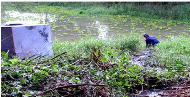
Fig. 5. Dumping the waste into a deep pond

1.4. Deep pond. A small percentage of pig farmers, who have very limited spare land, dump their pig waste into a deep pond on their farms. These farms are always located away from the neighborhood, because the waste (which is left in the pond for years) gives off a very bad smell. Therefore, the local government has to enforce protective regulations on these farmers.