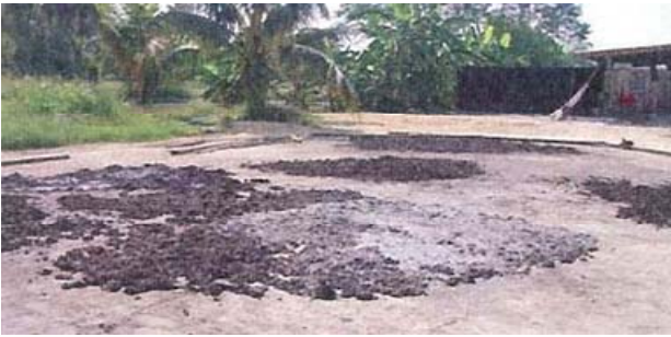
Fig. 4. Drying the waste before selling it as organic fertilizer

1.4. Deep pond. A small percentage of pig farmers, who have very limited spare land, dump their pig waste into a deep pond on their farms. These farms are always located away from the neighborhood, because the waste (which is left in the pond for years) gives off a very bad smell. Therefore, the local government has to enforce protective regulations on these farmers.