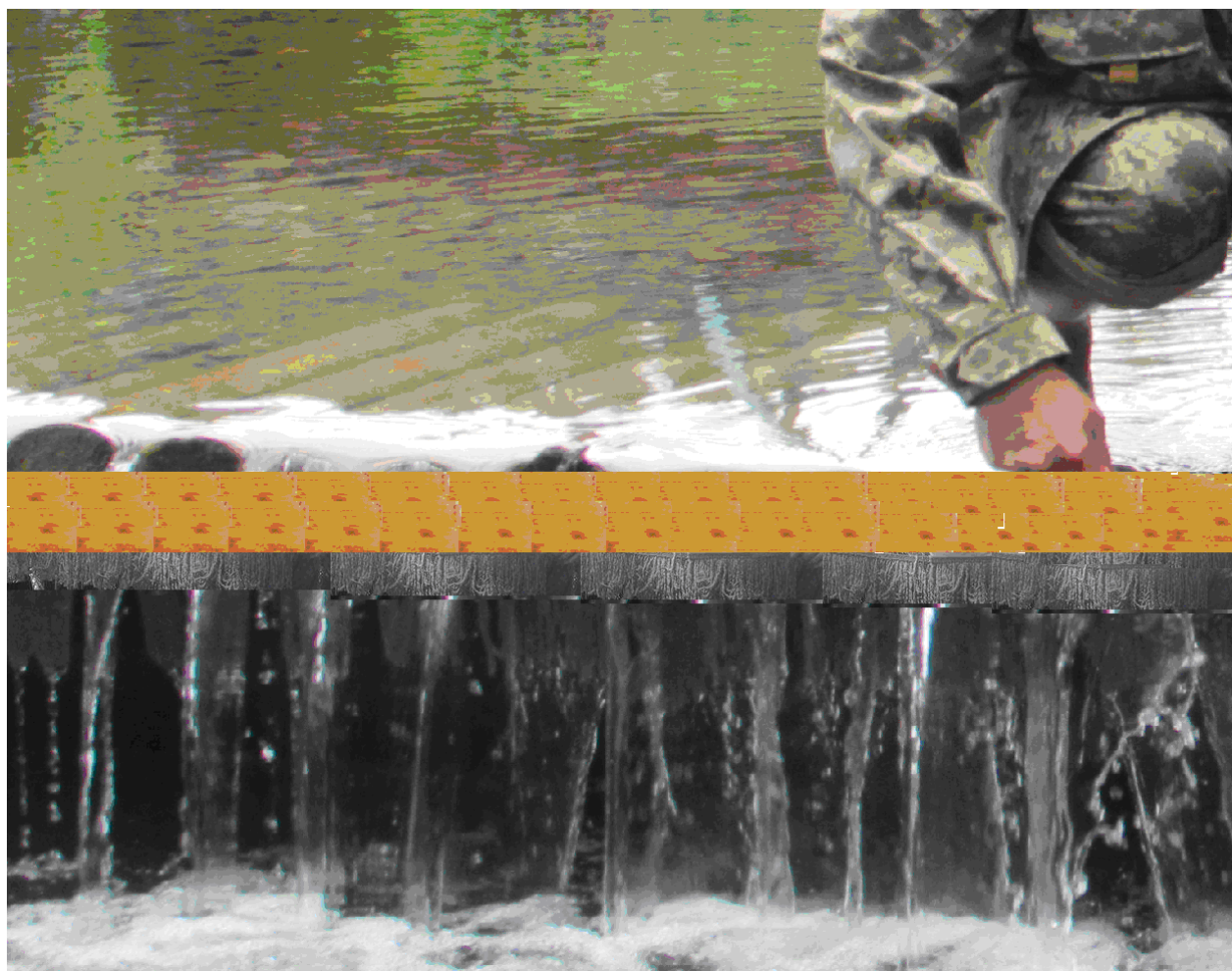
Fig. 3. A bioreactor-type structure based on a fibrous carrier “Viia” and wooden structures – “casings”