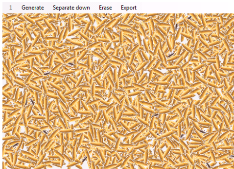
Fig. 3. The sample of grain before separation

As a result of separation, image of factions were got, that represented on Figs 3, 4 and 5. Image