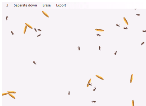
Fig. 5. Grain after the second test sieve