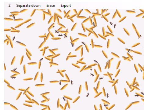
Fig. 4. Grain after the first test sieve

In the fourth phase after separation in the pallet are the smallest components of the whole sample: rubbish and small pests (5 %) (Fig. 6).