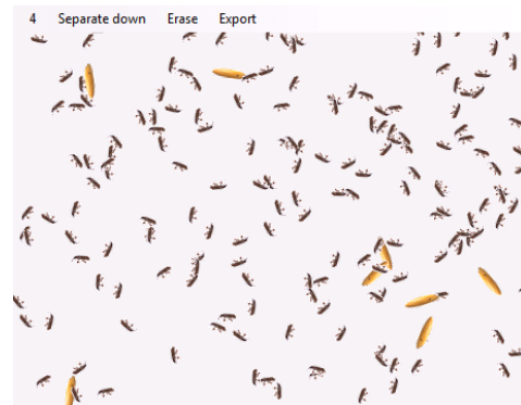
Fig. 6. Rubbish and small pests (5 %)

products." Workshop: Training. guide . Kyiv: Higher Education, 2004.