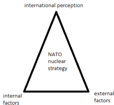
Figure 2. NATO nuclear strategy forming

As a result, NATO nuclear strategy forming system can be represented in a form of a triangle (Figure 2) with internal factors in one corner, external in another and the level of international perception on the top one.