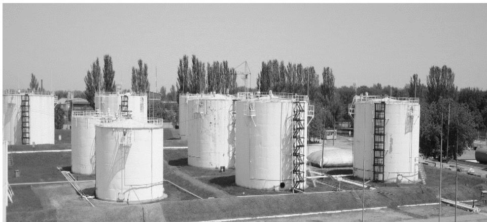
Figure 1 – Oil tanks type RVS (RVS-5000, RVS-3000)