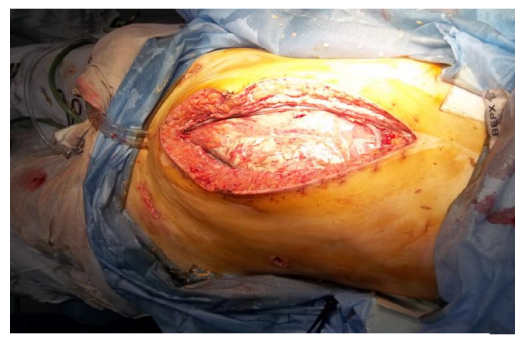
Figure 1. Placing the first multiperforated polyethylene sheet.