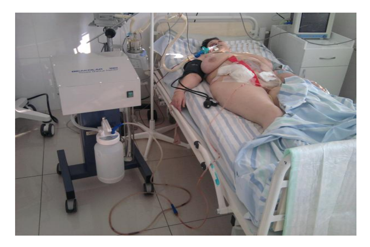
Figure 3. Treatment of postoperative peritonitis by vacuum.