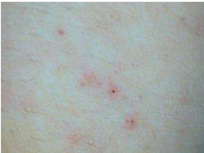
Fig.1.Paired follicular papules on the belly skin×10

Dermatoscopy findings. Dermatoscopy examination was carried out by "Aramo" video dermatoscope at 10-fold, 20-fold and 60-fold magnification. Dermatoscopy of the abdomen showed some paired follicular papules, covered with hemorrhagic crusts (Figure 1).