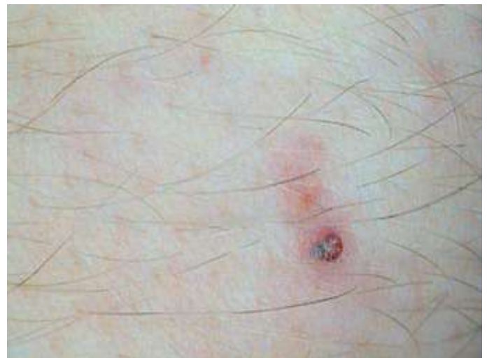
Fig. 3. The borrow on the skin of buttocks ×20.

The body of mite was visualized at the end of the burrow. Examination also revealed "jet trails" pattern in the form of small brown dots which usually contain feces of Sarcoptes scabiei (Figure 3).