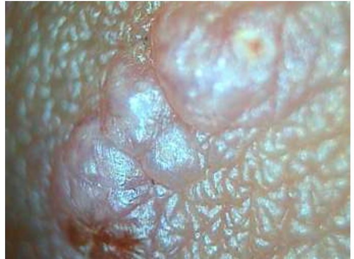
Fig.2.The mite burrow the skin of penis×60

The mite burrow with several holes linearly located on papulovesicular lesions (Figure 2) was detected by dermatoscopy of the penis. Dermatoscopy of the buttocks determined typical mite burrow filled with liquid.