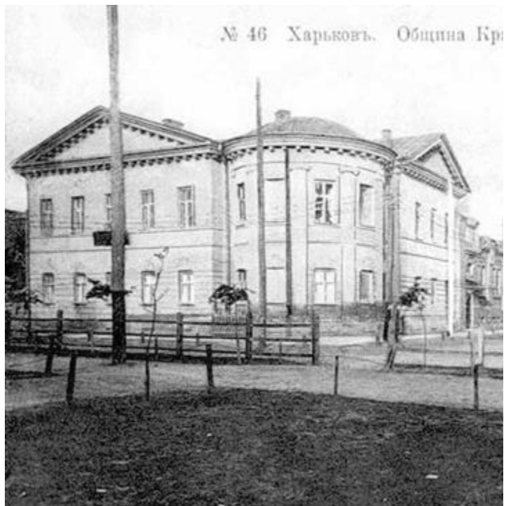
Fig.4 The building of Kharkov Red Cross hospital (up to 1912).

In 1914 Kharkov Red Cross hospital moved to a new, much more spacious and well equipped building, located at the same place (at present it serves as Southern Railway