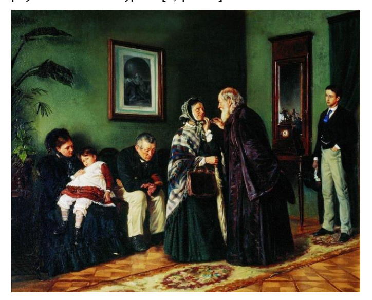
Fig. 3. "In the physician's waiting room" V. Makovskiy (1870)

However, assessing all the positive innovations of the Medical Charter (1905), it should be noted that the legal regulation of labour in the field of medical practice was far from perfect. Problems existed, for example, in standardizing physicians' labour. As M.B. Mirskiy stated, "district hospitals served a certain number of residents in the surrounding restricted area. According to calculations made by county physicians, one hospital is needed for 10 thousand people, and the service radius should not exceed 10 miles" [1, p. 43]. In turn, according to the standards for zemstvo medicine, 2 doctors had to serve 25 thousand residents in Chernihiv [4, p. 300]. In districts the burden on physicians was more uneven. For example, in Konotop district each physician had to provide service to 18 thousand residents with a total area of medical care in the 354 square miles. In Hlukhiv district one physician serviced 60 thousand residents in an area of 1363 square miles [3, p. 122]. As N.M. Pirumova noted, a physician received at least 60 patients a day. During public holidays their number upped to 100 people. The working day lasted at least 12 hours, not counting emergency cases and preparation of drugs [2, p. 106]. Also, the legislature did not consider the impact of special and hazardous working conditions on physicians and other medical personnel. As I.D. Strashun indicated, according to statistics about 60% of county physicians died of typhus [7, p. 114].