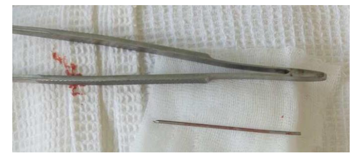
Fig. 4. A fragment of Kirschner's wire as compared to the size of surgical forceps.

There are cases of unsuccessful removal when the wire is fractured and its medial part migrates into soft tissues. A foreign body unnoticed or left in soft tissues becomes an infection lesion around which infiltrate or abscess is likely to form. It is also likely that a fistula may form around the foreign body. Originally, sterile foreign bodies, such as Kirschner`s wires, get encapsulated after osteosynthesis without abscess, however, there is a risk of infection [7, 8, 9, 10].