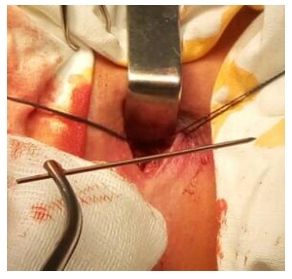
Fig. 3. A fragment of Kirschner's wire

On 17 May 2017, the foreign body in the left supraclavicular region was removed under general anesthesia. The skin and subcutaneous tissue over the foreign body were lanced under ultrasound control by the projection route based on the prior marking. During the instrumental inspection of the foreign body location from its lateral edge, the foreign body end was identified 2-2.5 cm deep under the skin, seized with the Kocher's forceps and removed (Fig. 3.). Hemostasis was dry. The post-operative wound was sutured layer-wise. The wound was drained with rubber tube drainage. Iodine. Aseptic bandages.