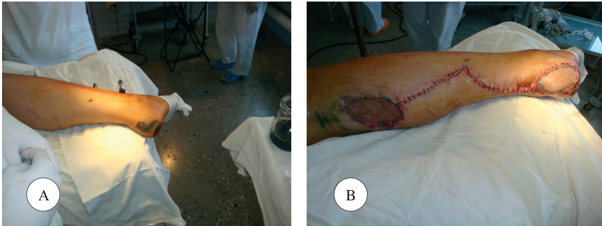
Fig. 2 A, B. Plastic wound defect with five islet flaps with a nourishing stalk (S. S., Case No 20414).

maged skin and underlying tissues to deep fascia, the flap with a nourishing stalk was not used because of the lack of indications for reconstructive interventions.