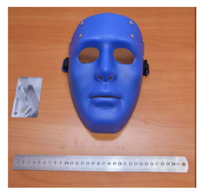
Fig. 1. Appearance of operating part of the system for carrying out cosmetology procedures.