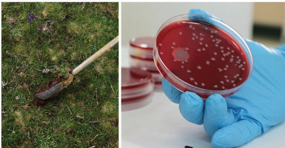
Figure 2. Application of molecular bioforensic tools used for investigating the genetic diversity of B. anthracis

The recent study on B. anthracis microevolution at aged anthrax foci (Pollino National Park, Italy) (Braun et al., 2015) amended PHRANA with whole genome sequencing in order to increase resolution power of genetic analysis (Fig. 2). For this, the genetic diversity of randomly picked B. anthracis -isolates was compared by 31-Loci MLVA, 4-loci SNR analysis and whole genome sequencing. MLVA-31 analysis of 114 isolates only revealed three differences, none of which in near-surface isolates. Similarly, SNR 4-loci-screening of 174 isolates yielded 18 differences with very similar percentage of occurrences of SNR-variants in near-surface (9.9%) and near-carcass (10.9%) isolates.