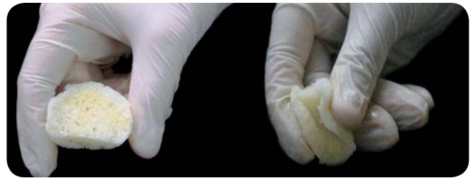
Figure 1. Demineralized bone elastic matrix.

A perspective direction has been proposed in clinical use of the obtained medical preparation in surgical treatment of the fractures which do not grow together, artificial joints and other disturbances of bone regeneration. In clinic, the bone micro granules are used separately or in the mixture with thrombocyte-enriched plasma, stem cells and other biologically active agents (Fig. 2).