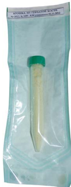
Figure 2. Trabecular bone chips.

New methodology for bone tissue demineralization with the use of acids and more sparing neutral agents has been first developed in Ukraine. Experimentally, the optimal concentrations and decalcination modes were chosen. Demineralized bone matrix (DBM) is made from both, cortical and spongy bone tissue, depending on necessary properties of the preparation. Using the DBM, the plastic can be performed on especially complex defects requiring high plastic properties of the material. Besides the DBM has a considerable osteo-inductive potential.