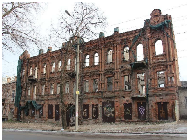
Figure 4. Home address street Beconase, 17