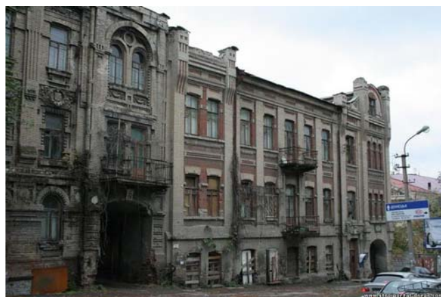
Figure 5. The complex houses on the street address Artem 22,24,26.