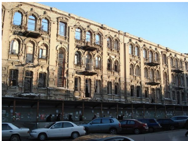
Figure 3. «Pomerantsev's House», Kharkivska, 6