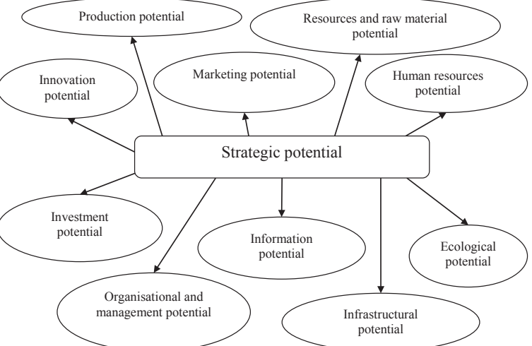
Fig. 1. The structure of strategic potential

3) forming the strategic potential methods of diagnosis, quantification of components of