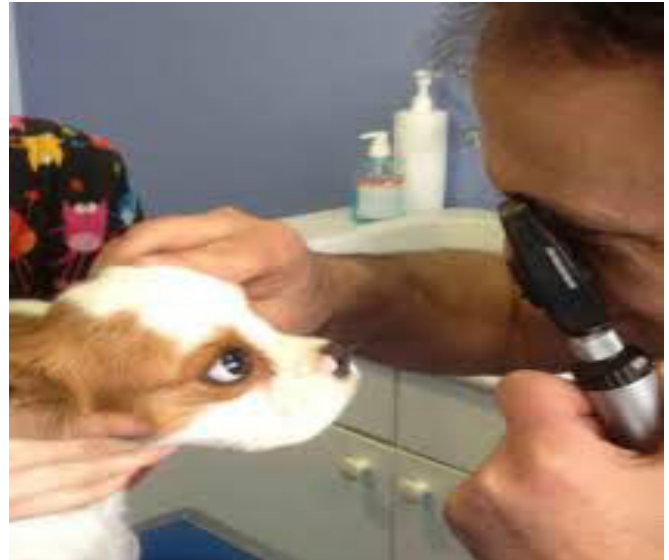
Fig 1. Taking intraocular pressure and fundus examination of a dog

pressure, the appearance of the optic nerve and visual field. Generally [9], a recording of the visual field is carried out every 6-12 months and therapy is possibly modified in case of unfavorable visual field or optic nerve. In our practice was used an anti glaucoma (NB timolol 0.25 and 0.50).