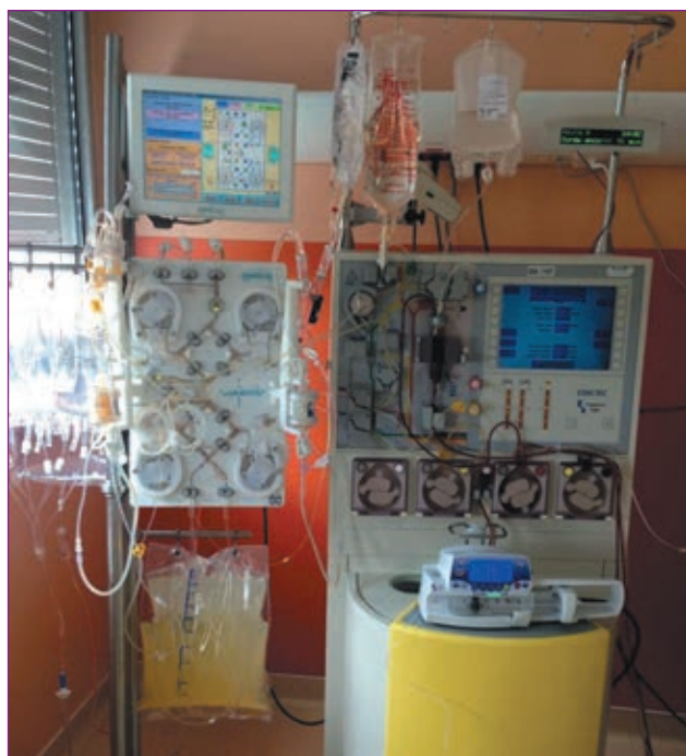
Figure 1. The generators used to perform immunoadsorption. On the left of the image is the ADAorb® generator, and on the right hand side, the Com.Tec® generator

In the setting of HLAi kidney transplantation, the recipient may have donor-specific alloantibodies (DSA) at pre-transplant. DSA can then act against HLA class I (A, B, or Cw) and/or HLA class II (DR, DQ, or DP) antigens. If DSAs are left, they quickly cause acute antibody-mediated rejection at posttransplant, despite immunosuppression [12]. Therefore, for pairs in whom the recipient has DSA(s) against the donor, we need to implement a desensitization protocol at pre-transplantation. This relies: 1) on removing DSAs by via plasmapheresis, 2) preventing their subsequent synthesis using rituximab infusion; and 3) starting conventional immunosuppression, i.e., tacrolimus, mycophenolic acid, and steroids at 7–10 days pre-transplantation [11]. Desensitization can also include intravenous IV-Ig infusions (for