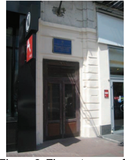
Figure 2. The entrance of the National University of theatre, cinema and television of Karpenko-Kary academic building on Khreschatyk Street, 52

The common characteristic of the National Universities academic buildings territories is that in most cases the main entrance to the building is fixed by an axial