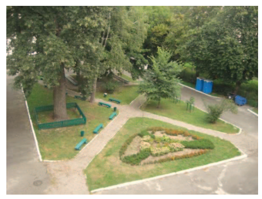
Figure 4. The National University of Life and Environmental Sciences of Ukraine courtyard

Another common feature of National Universities recreation areas is the fact that in most cases they are located in courtyards ranging from 300 M<sup>2</sup> to 0,7 hectares, for example the academic buildings territories of the National University of Life and Environmental Sciences of Ukraine (building number № 1 (General Rodimtsev Street, 19)) (fig. 4) and building № 6, (Vasylkivska Street, 17), Kyiv National University of Construction and Architecture (Povitroflotsky Avenue, 31), National Economic University named after Vadym Hetman (buildings № 5 and 6 in Melnikova Street, 81), National University of Physical Education and Sport of Ukraine (Fizkultury Street, 1), Kyiv National Linguistic University (Velyka Vasylkivska Street, 73), National University of Food Technologies (Volodymyrska Street, 68) (fig. 5), Kyiv National University of Technologies and Design (Nemirovich-Danchenko Street, 2), National Pedagogical Dragomanov University (Institute of Sociology, Psychology and Management building, Sarativska Street, 20), Taras Shevchenko National University of Kyiv (Institutes of Journalism and International Relations building, Melnikova Street, 36/1) and National University of "Kyiv-Mohyla Academy" (buildings№ 4, 4<sup>a</sup>, 5, 6 i 7, Voloska Street, 10).