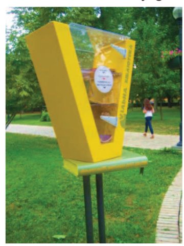
Figure 7. "Free street library"

formation is an open and closed spaces combination and creating the centers of individual and group recreation around them. Important elements of these spaces are trees, with thick crowns for shade. Therefore, it is important to preserve existing trees in the territory organization process, complemented with beautiful flowerbeds. Equipped with a high level insolation the creation of areas with ordinary garden-park or Moorish lawn is recomended.