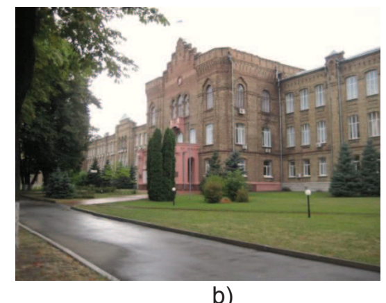
Figure 3. Territories around the main entrance of the academic buildings of: a) National Aviation University; b) National University of Defense of Ukraine named after Ivan Chernyakhovsky