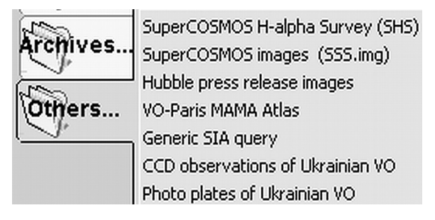
Figure 6. Selection of image servers via Aladin.

We continue to expand and populate the databases.