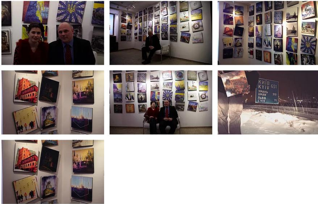
Fig.2. The exhibition of Electronic Social Art in Kyiv after events in Kyiv, in 2013-2014.