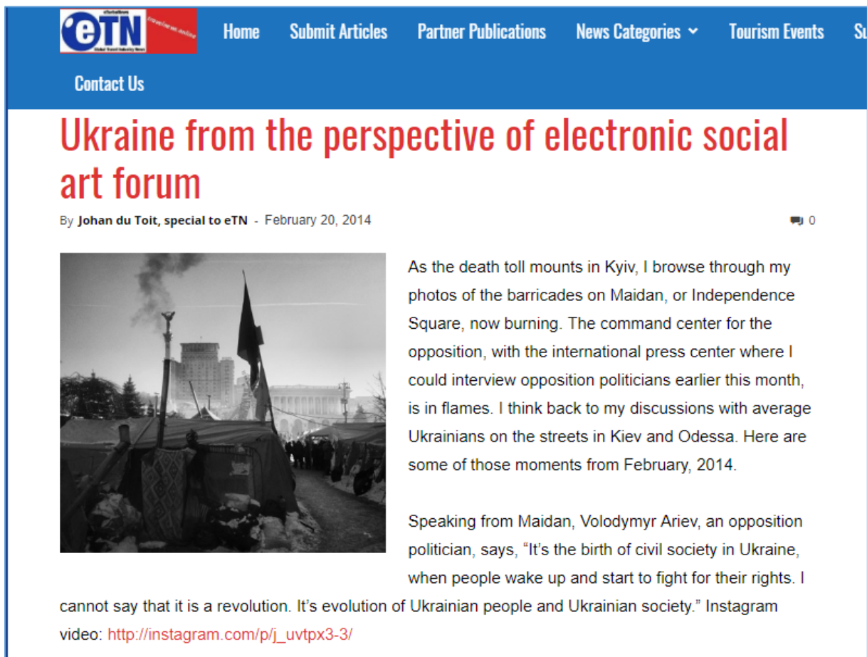
Fig.3. The article from Electronic Social Art, after events in Kyiv, in 2013-2014.

Mediatory function of Electronic Social Art as a social mediator, establishing links between the structures of society. It allows different social groups to communicate with each other and establish contacts. "The media is not power, but power, sometimes very significant, expressing public opinion and affecting real power, sometimes even limiting its possibilities." And from here a conclusion: Electronic Social Art is an intermediary between a society and the state, between society and the power. The mediation function is intensified in the period of the formation of a civil society based on the principles of democracy and freedom. In the same way as during the political events in Ukraine in 2014, representatives of Electronic Social Art actively covered them. (Fig.3):