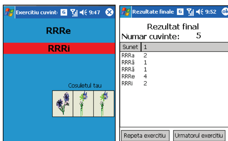
Fig. 3. The PronouncingWords module