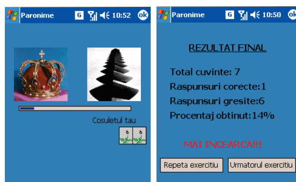
Fig. 2. The Paronyms module

This application executes the exercise implementation of recognizing a word from a group of two paronyms (for instance, duck – dog). On starting the application, a window where START button is placed will be displayed. After pressing the START button, a text will be displayed in the window (of presenting the exercise) and an audio sequence is played-back, by which the exercise is described.