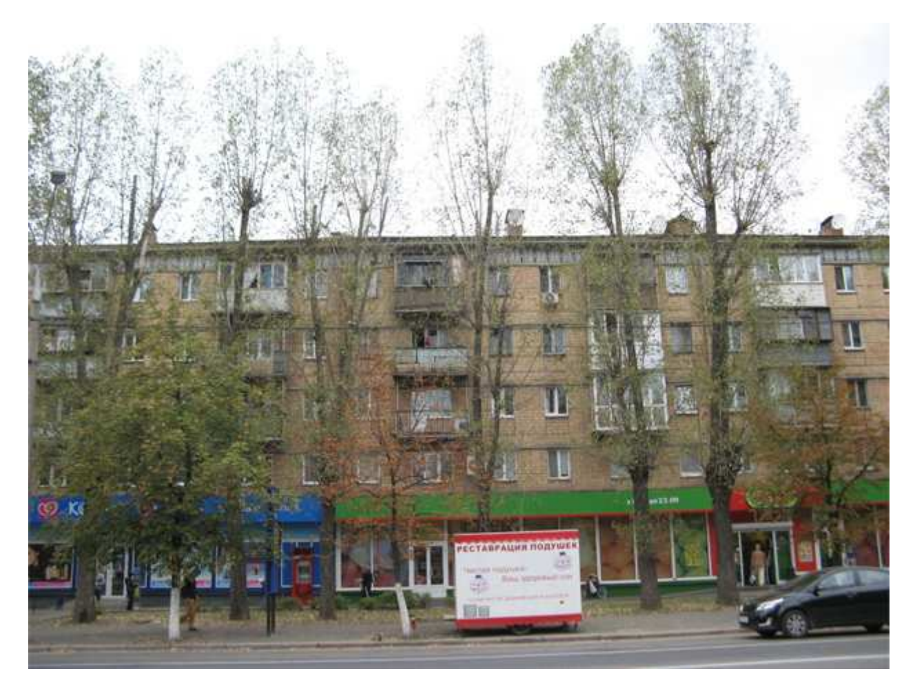
Fig. 4. Defoliation of poplar trees along Vidradnyi avenue of Kyiv city in August 2013

Moth imagoes with lighter color of wings accumulated on chestnut bole and leaves (Fig. 5). Also it is noticed attention the fact that the lesion degree of chestnut tree leaves, that were near the poplar trees, by horse chestnut leafminer moth C. ohridella at that time was minimal and was determined to 5-10 % of the leaf surface, that is also evident from Fig. 5.