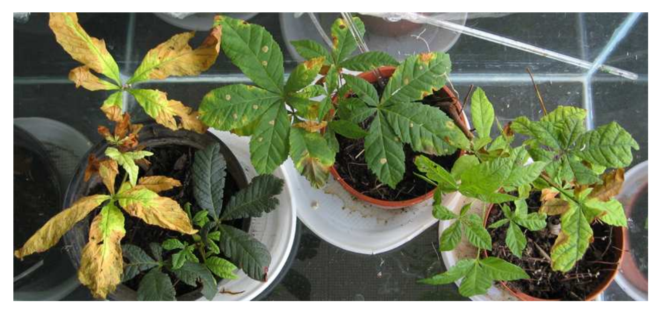
Fig. 8. Formation of mines on the leaves of chestnut in 3-rd day after insects introduction