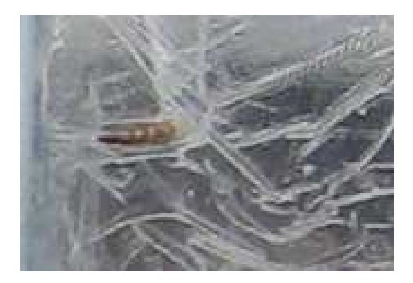
Fig. 12. Change of imago wings color

When observing the leafminer moth imagoes, which began to emerge from mines in 20th day after the beginning of the mines formation, immediately our attention was attracted to change of wings color of daughter imagoes (Fig. 12) compared with the wings color of the parent individuals (Fig. 2), which were released in the aquarium for the infection of horse chestnut plants. All eight emerged imagoes were with the same wings color, which was identical to the typical wings color of horse chestnut leafminer moth C. ohridella .