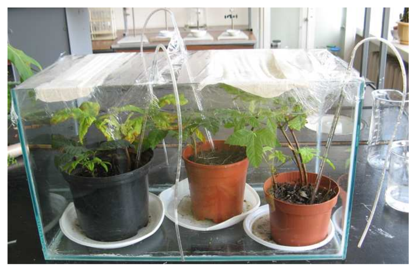
Fig. 7. One-year old horse-chestnut trees were placed in a glass aquarium for creation of isolated conditions with possibility of watering through tubes

Inside the aquarium with pots we released imagoes of leafminer moth with a distinctive bright color of the wings collected from damaged poplar trees. After three days the formation of mines on the upper surface of horse chestnut leaves have been seen (Fig. 8).