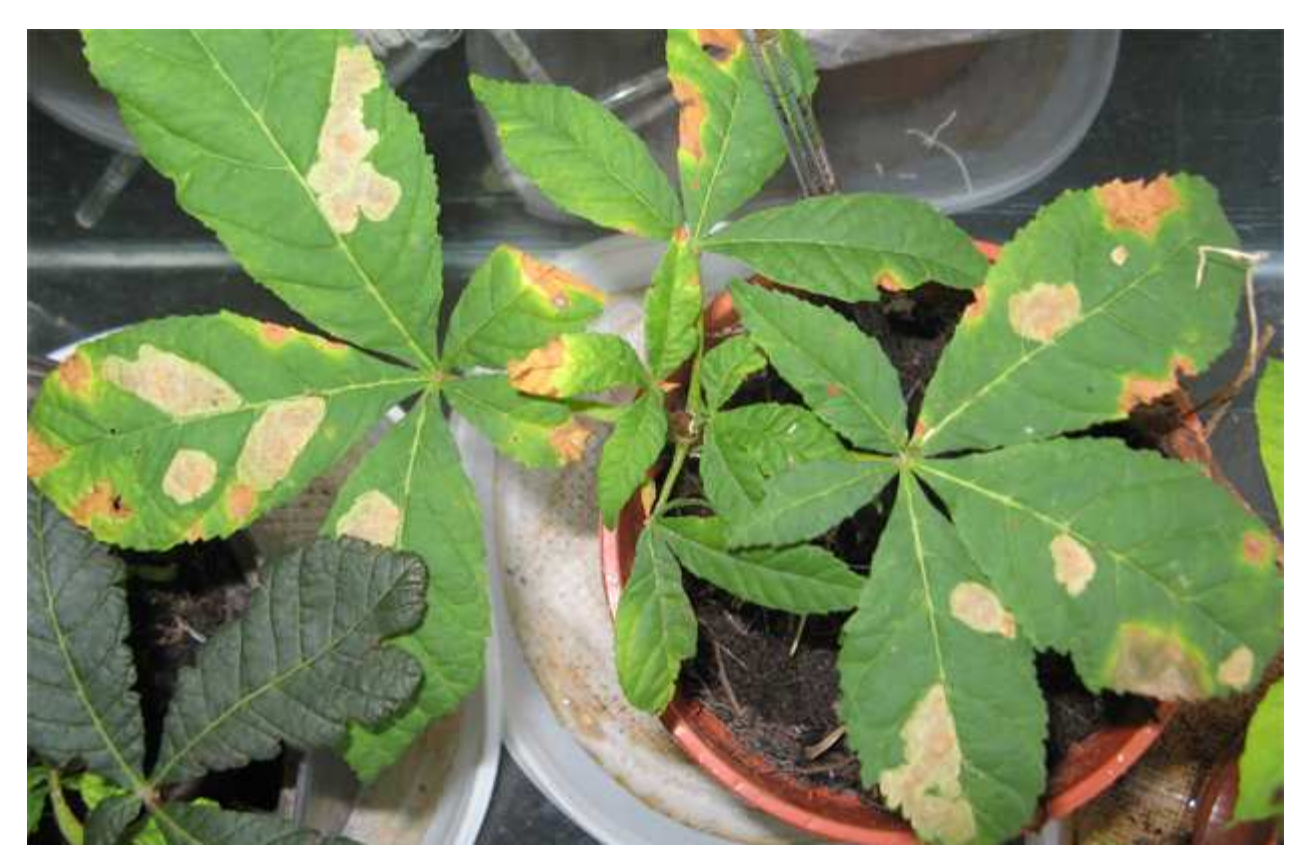
Fig. 9. Formation of mines on the leaves of chestnut: 9-th day