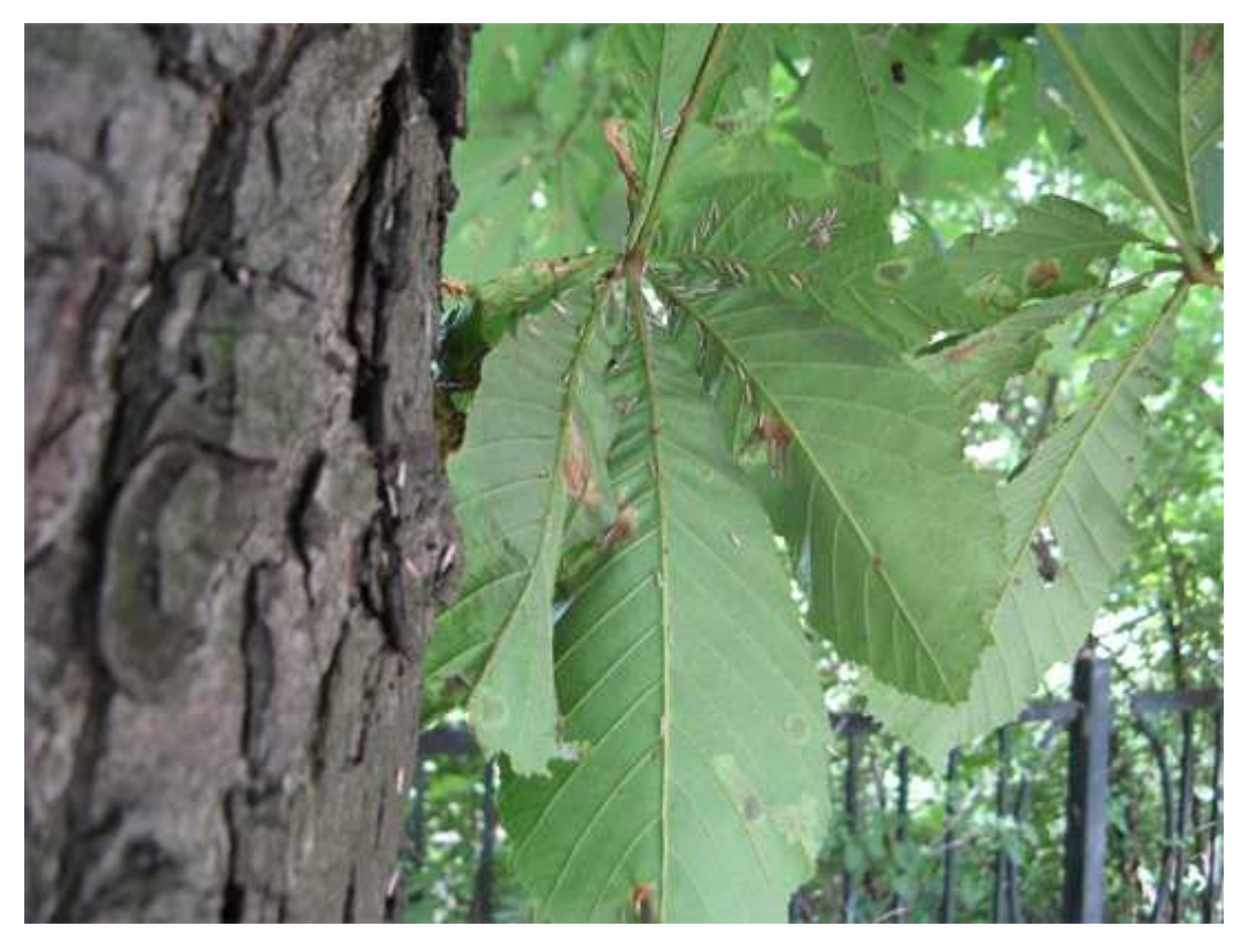
Fig. 5. Imagos on bole and leaves of horse-chestnut tree

Trophic features of leafminer moth during the outbreak observed in Kiev in 2013 are summarized in the table 1.