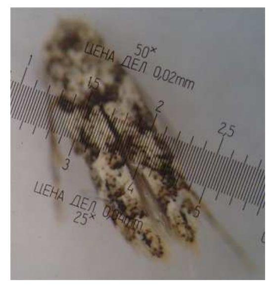
Fig. 2. The appearance of adult stage leafminer moth (x25)

Caterpillars of leafminer moth feed on the sap of plant epidermal cells first, and then – leaf parenchyma, forming in them typical by form and color mines – a hollows