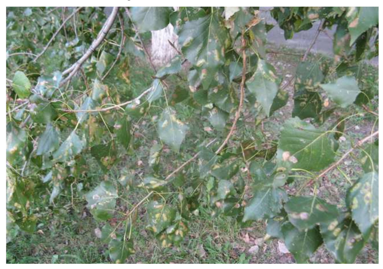
Fig. 1. Poplar leaves damaged by leafminer moth (September 2012)

morphologically similar to horse-chestnut leafminer moth Cameraria ohridella Deschka & Dimic, 1086 (Fig. 2).