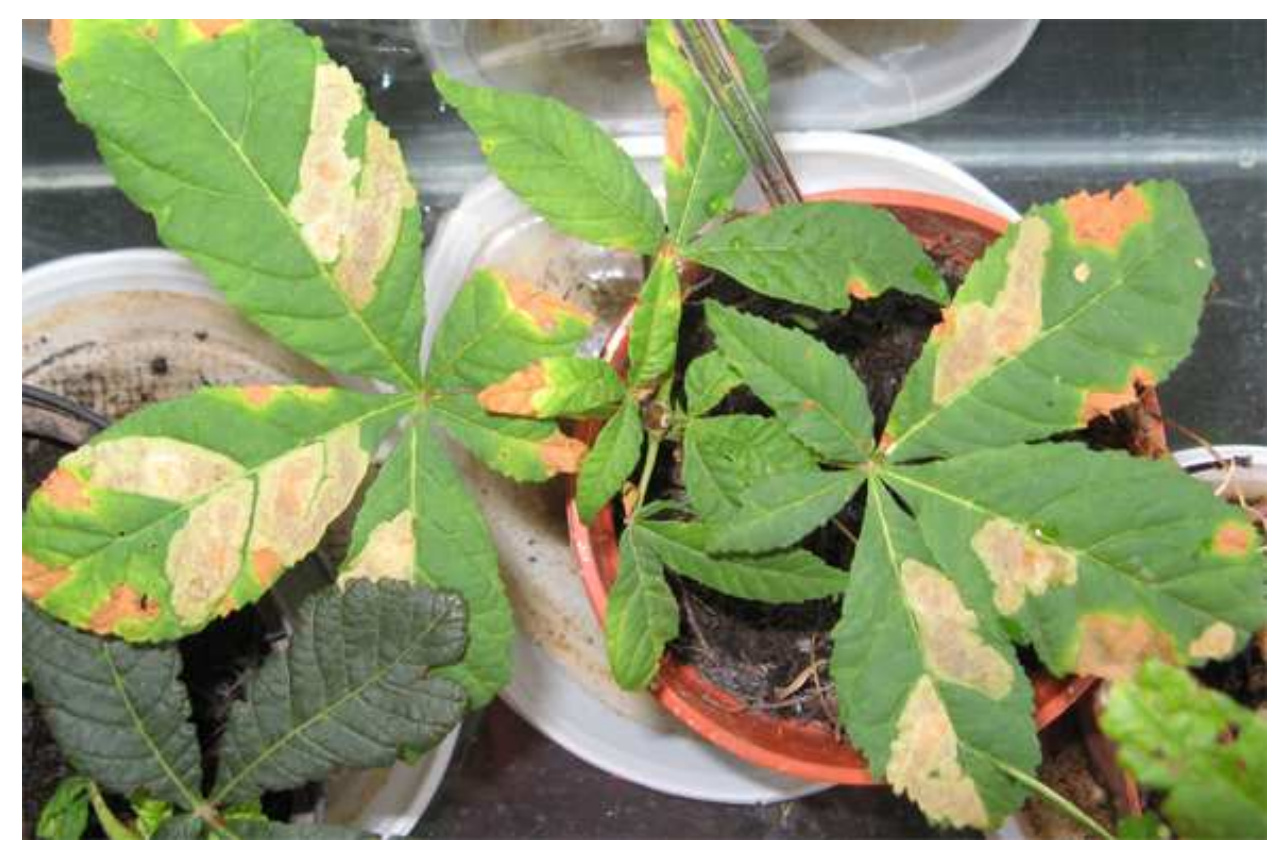
Fig. 10. Formation of mines on the leaves of chestnut: 13-th day