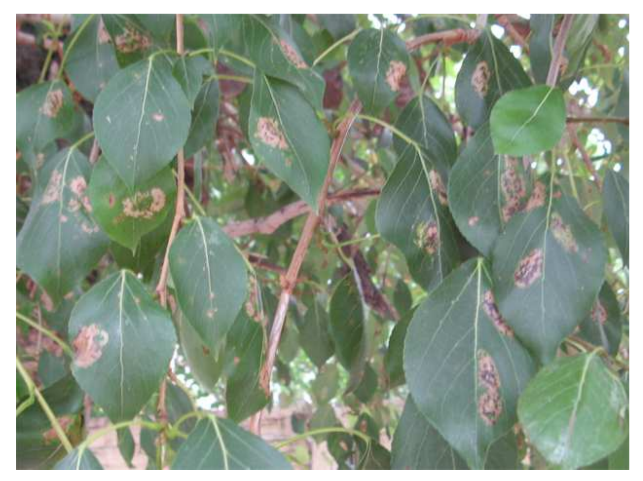
Fig. 6. Lesion of balsam poplar leaves by leafminer moth

The localizations of moth imagoes on bole of lime trees that grew nearby were identified, but signs of lime leaves lesion were not identified in the future.