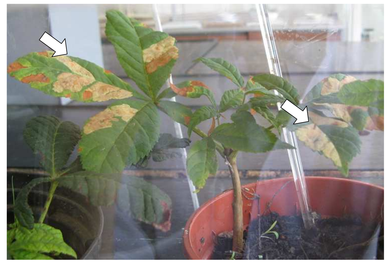
Fig. 11. Leafminer moth pupa cases on the leaves of chestnut (20-th day)