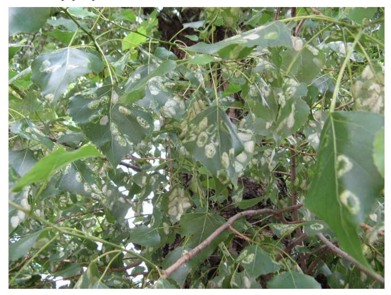
Fig. 3. Outbreak of leafminer moth on the poplar leaves (June 2013)

Results and discussion. The degree of poplar leaves lesion by leafminer moth reached 90-100 % in early June (Fig. 3), it is possible to argue about an abnormal outbreak of poplar pest insect number.