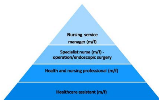
Fig. 1. The nursing professions at the qualification levels of occupations

According to the definition used in Classification of Occupations of 2010, professions are classified according to the level of requirements or the complexity of their activities. A distinction is made between four requirement levels and complexity levels. Thus, the professions of nursing personnel at the qualification levels of occupations are divided into the following groups: 1st qualification level – level of helpers and trainees (e.g., healthcare assistant), 2nd qualification level – level of skilled workers (e.g., health and nursing professional), 3rd qualification level – level of specialists (e.g., Specialist nurse (m/f) – operation/endoscopic surgery), 4th qualification level – level of experts (e.g., Nursing service manager) (Figure 1) (Bundesagentur für Arbeit, 2010; 2017).