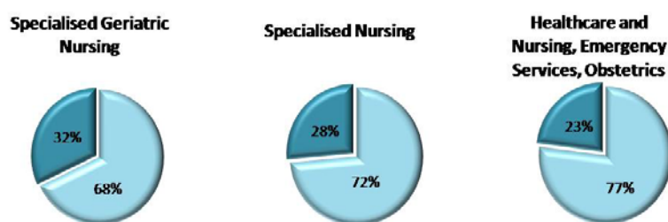
Fig. 4. ■ Shortage of specialists

Creating a new general nursing profession from the existing three independent nursing professions in geriatric nursing, healthcare and nursing, healthcare and paediatric nursing met with considerable resistance, especially in the care of the elderly. Later the coalition parties have agreed in the spring of 2017 on a political compromise on the reform of the nursing profession. Despite some criticism, the German Bundestag, with the consent of the Federal Council of Germany (Bundesrat), finally adopted on 17 July 2017 the new German Nursing Professions Act (Pflegerberufegesetz, PflBG) (Bündnis für Altenpflege, 2017; DBfK, 2018).