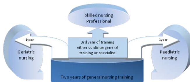
Fig. 5. General nursing training after 1 January 2020

All applicants starting to train as skilled nursing professionals after 1 January 2020 will undergo two years of general nursing training. In the third year of training, apprentices will either continue general training to become general nurses – skilled nursing professionals (Pflegefachfrau/Pflegefachmann) or specialise to become a geriatric nurse or a paediatric nurse. Besides, they can choose the training option that exactly fits their needs. Another plus of this general nursing training is that it is recognised across the EU or the European Economic Area, giving individuals working in nursing even more job opportunities. The new nursing training programme will be completely free of charge, and apprentices will receive adequate remuneration. Nursing professionals will have better opportunities for finding work, changing jobs, being promoted and for personal development in all areas of nursing care (BMFSFJ, 2018; DBfK, 2018; Make it in Germany, 2018) (Fig. 5).