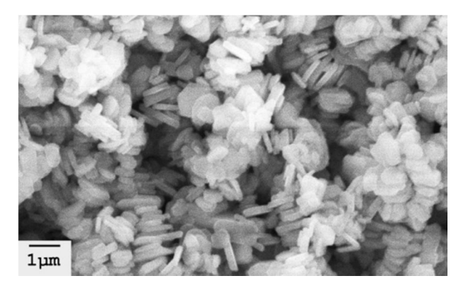
Fig. 1 – Electron microscopy image of particles of the initial BaFe12O19 powder sample and the thickness distribution of the particles.

L.P. OL'KHOVIK, Z.I. SIZOVA, E.V. SHURINOVA ET AL.