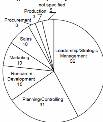
Fig. 2. Participants by functional areas

In a next step we conducted an exploratory factor analysis 1 . Factor analysis is a collective term for the