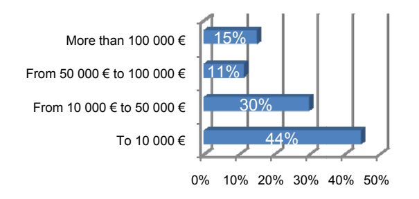
Fig. 1. Franchise categories based on initial fee criteria (N = 27)

In order to verify H1, respondents answered the question regarding franchise category based on the initial franchise fee. Results show that the majority of franchises participating in this survey belong to the low price category as the entrance fee for 44% examined companies was less to 10 000€, and for 30% is between 10 000€ and 50 000€. Middle price category, between 50 000€ and 100 000€, suited 11% of respondents and the high price category suited 15% of respondents. The total percent of entrance fees less 50 000€ accounted therefore to 74%, what makes the majority of all respondents. The H1 is confirmed, and the results are presented in Figure 1.