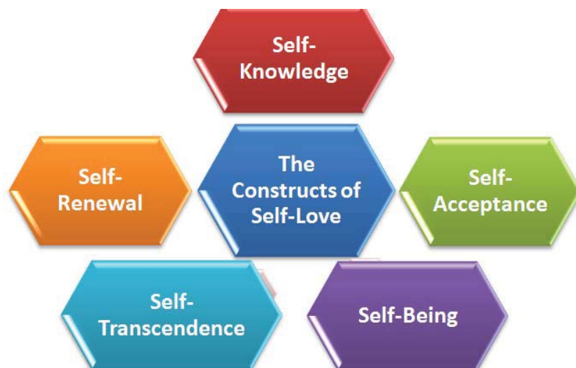
Fig. 1. The constructs of self-love model

Based on the synthesis and deconstruction of the meaning of self-love from the literature review, five constructs of self-love were formulated, namely: Self-Knowledge , Self-Acceptance , Self-Being , Self-Transcendence and Self-Renewal .