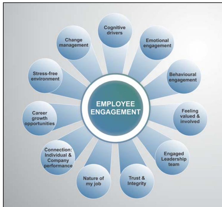
Fig. 1. A theoretical model to measure employee engagement

4.12. Theoretical model of employee engagement. Based on the theoretical study and the identified constructs (as per Table 1) the theoretical model of employee engagement is presented in Figure 1.