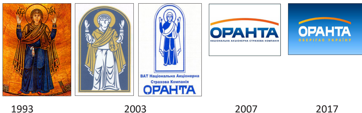
Figure 1. Evolution of the logo of the NJSIC Oranta (Ukraine) over the 1993–2017

There are also other interpretations of corporate identity after re-branding. For example, V. Iskra sees symbolism in the fact that the affairs of the company were transferred from the divine hands to the hands of men, offsetting the original meaning of the company name. The logo, instead of the image of the Virgin Orans with Her hands in prayer, now has an “umbrella”, symbolizing protection by the company of its clients from ev-