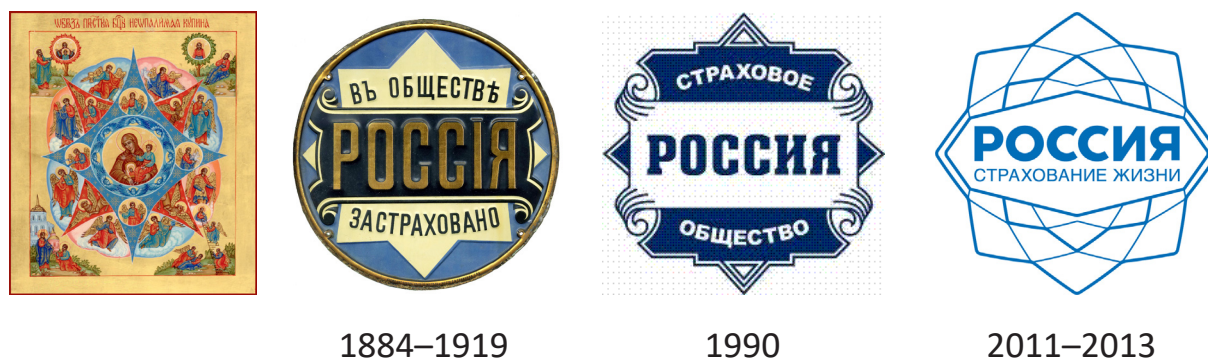
Figure 3. Evolution of the logo of the insurance company “Russia” over the years 1884–2013

“Insured with Rossiya Insurance Company”. On the flip side, as a rule, the following information was engraved: policy number, surname, and first name of the policyholder. Each client of the company, who had a badge from Rossiya, became a potential “carrier” of the company’s advertising as such badges were intended for wearing on a pocket watch chain hanging on a jacket, and such watches were an attribute of the image of a business person or wealthy gentleman (Razuvaev & Borzyh, 2006). In modern collections we can see insurance badges with inscriptions in both Russian and Polish languages.