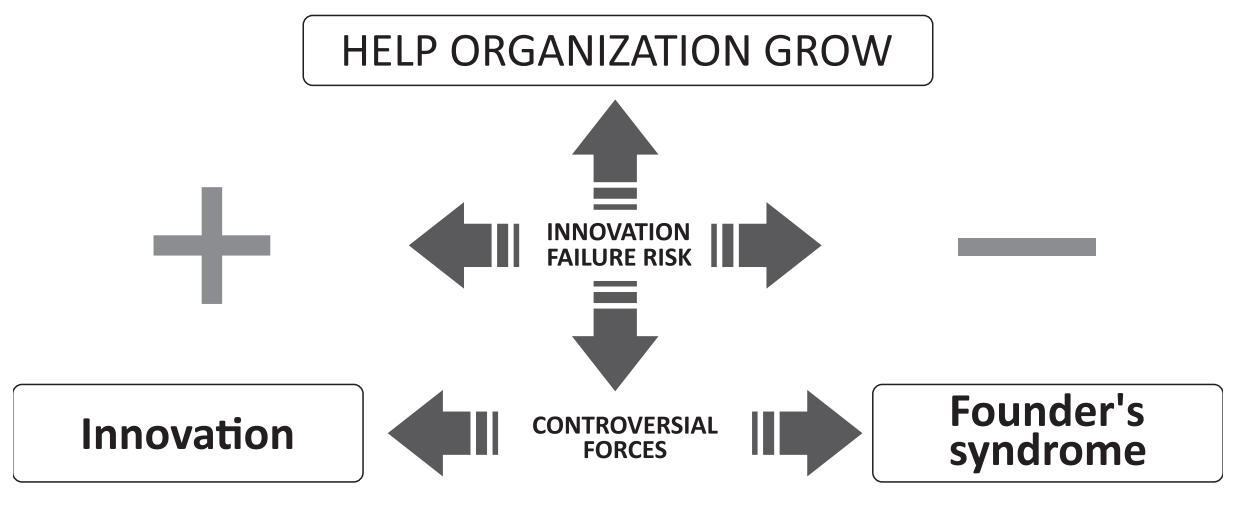
Figure 1. The model for analysis

Although this research is designed and directed to achieve the requirements of a qualitative approach, the analysis has been conducted quantitatively and the sample tested included four companies that vary in scale, size, business line, number of employees, sectoral activities, corporate governance structure and management culture. Therefore, the examined portfolio contained different styles of entrepreneurs and business founders.