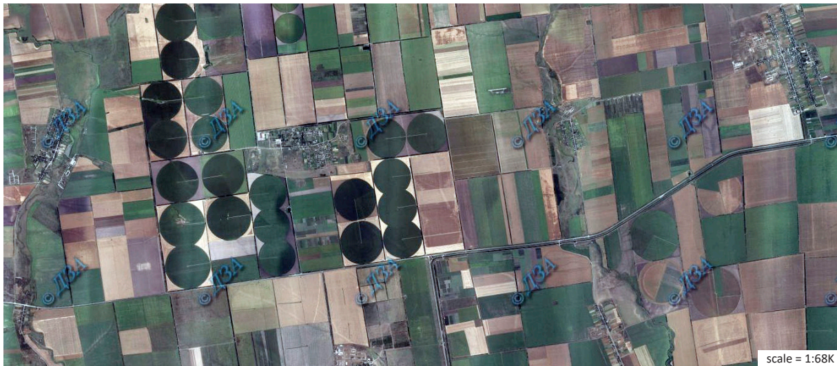
Figure 6. Orthophoto image of key plot 3

On Figure 6, typical pattern of surge irrigation – green circles – can be seen easily. Some of these circles are very contrast, thus owners of small land parcels manage irrigation together or rent their land to a single farmer. Some of these circles on the right side of the image are hardly noticeable, then, irrigation was interrupted, but physical properties of cultivated soil were changed already.