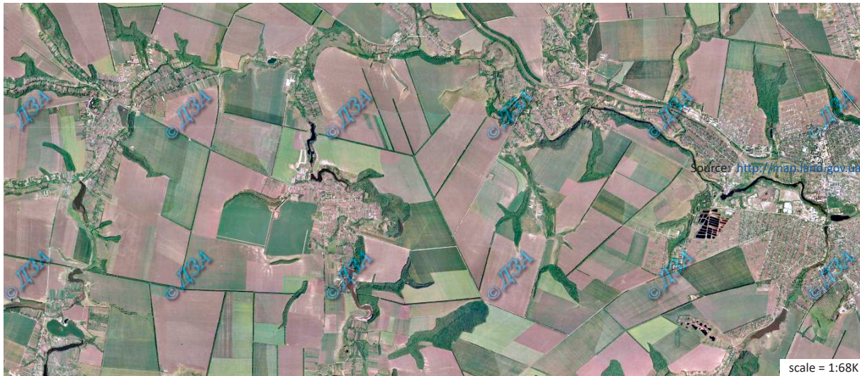
Figure 4. Orthophoto image of key plot 2

ownership, it may contain not only agricultural lands, but also forestry or mining.