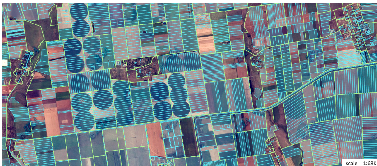
Figure 5. Cadastral map of key plot 3

The third key plot was chosen near Vysoke village of Melitopol district of Zaporizhia region in steppe zone (Figures 5, 6).