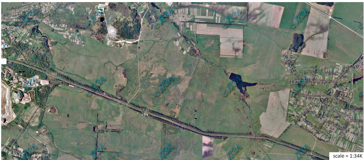
Figure 2. Orthophoto image of key plot 1