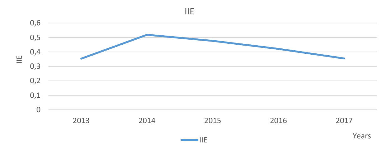
Figure 2. Dynamics of the general level of development of export-import activity of PAT "Turboatom"

environment at the level of development of exportimport activity of the enterprise, it is necessary to calculate multifactorial regression models. Such models of influence of environmental factors at the level of development of export-import activity of PAT "Turboatom" are as follows: