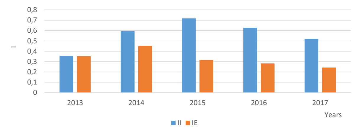
Figure 1. Dynamics of levels of development of export activity (IE) and import activity (II) of the enterprise PAT "Turboatom"

Consequently, at the given enterprise over the last four years there has been a decrease in the general level of development of export-import activity. To correct this situation, it is necessary to analyze the influence of levels of development of export and import activity of the enterprise on the income from sales of the enterprise's products. The model of the dependence of this indicator of the effectiveness of the activity from the levels of development has the form: Y = 2.164 - 1.9609II + 3.5434IE, with the determination coefficient R^2 = 0.555 . calculated Fisher's criterion 1.25. That is, with an increase in the level of development of export activity by 0.1, the income from sales of the enterprise will increase by UAH 0.35434 billion, while with a decrease in the level of development of import activity by 0.1, this revenue will increase by UAH 0.19609 billion. The management of an enterprise should take into account this fact in order to increase the efficiency of management of its export-import activity. Next, to determine the influence of the factors of external and internal