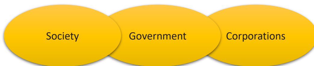
Figure 2. Interests linkage among the corporations, the government and the society

enced by organizational efforts in realizing their goals. The main stakeholders are those who have a contractual relationship with the organization and are influenced by the actions of the organization, even though they have no contractual relationship with the organization. The contractual relationship of the company as a corporate taxpayer with the government and society can be seen in Figure 2.