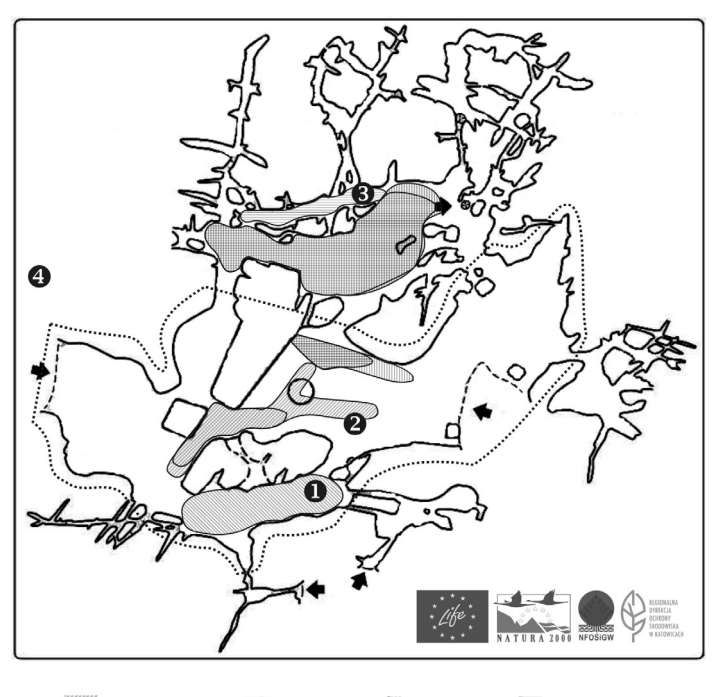
B. barbastellus M. myotis P. auritus M. nattereri

Fig. 1. The scheme of the Szachownica cave (after: Zygmunt, 2016).