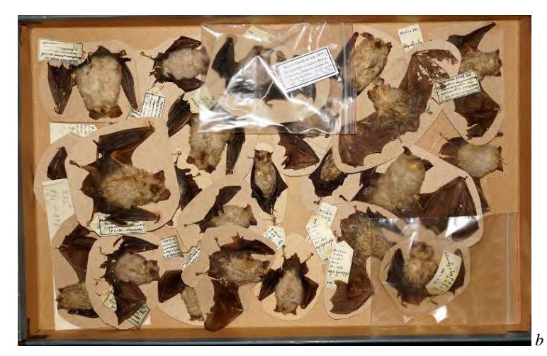
Fig. 2. Bats in the collection of ZMD: a— one of the oldest specimens of bats in the Museum, Nyctalus lasiopterus ; b— a box with study skins of bats as an example of their storing in the Museum.