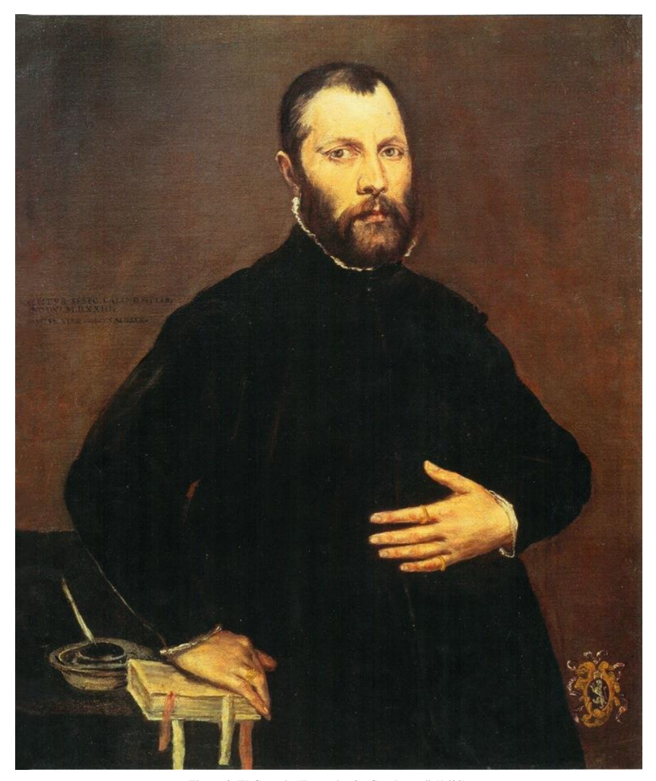
Figure 2. El Greco's "Portrait of a Gentlemen" (1600)