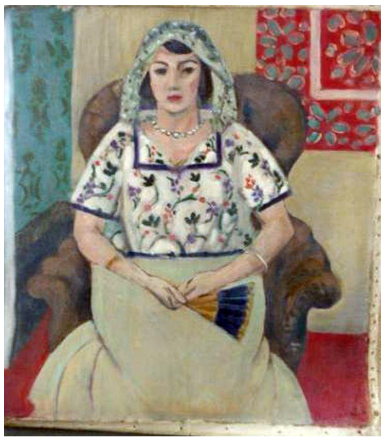
Figure 1. Matisse's "Seated Woman"

Speer allowed for the confiscation of art that ended up in the collections of such individuals as Speer, with greater amounts going to such Nazi leaders as Herman Goring (Winter, 2013). A notable painting was Matisse's "Seated Woman" (1921). This masterpiece was one of many art works he acquired through theft, an art work eventually reunited to its rightful owners (NPR, 2015).