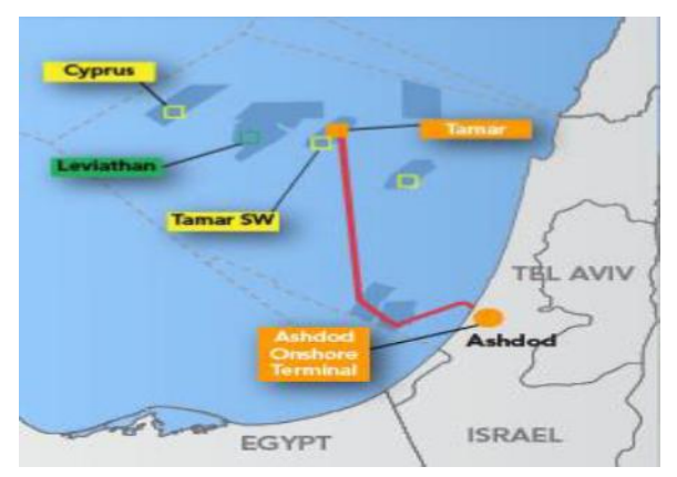
Figure 1. Levant Basin: Oil & gas finds

Much of the hydrocarbons in the Eastern Mediterranean have gone undiscovered because the resources lie in the seabed under very deep waters. These depths exceed two km in some locations and made drilling in the area a difficult, risky and expensive business. At the dawn of the 21st century, recent technological advances, accompanied by high international oil prices, prompted new exploration initiatives. The rapid advances in micro-processing made the analysis of vastly more data possible and facilitated geophysicists in greatly improving their interpretation of underground structures and, consequently, exploration success (Yergin, 2011: 40). These technological advances had an enormous impact on the energy developments around Cyprus as well. In March 2010, the U.S Geological Survey estimated a mean of 122 trillion cubic feet of recoverable gas in the seabed of Levant Basin Province, located along and off the coast of Syria, Lebanon, Israel, and the Gaza Strip, extending westward into Cypriot waters (see Figure 1. Levant Basin: Oil & gas finds).