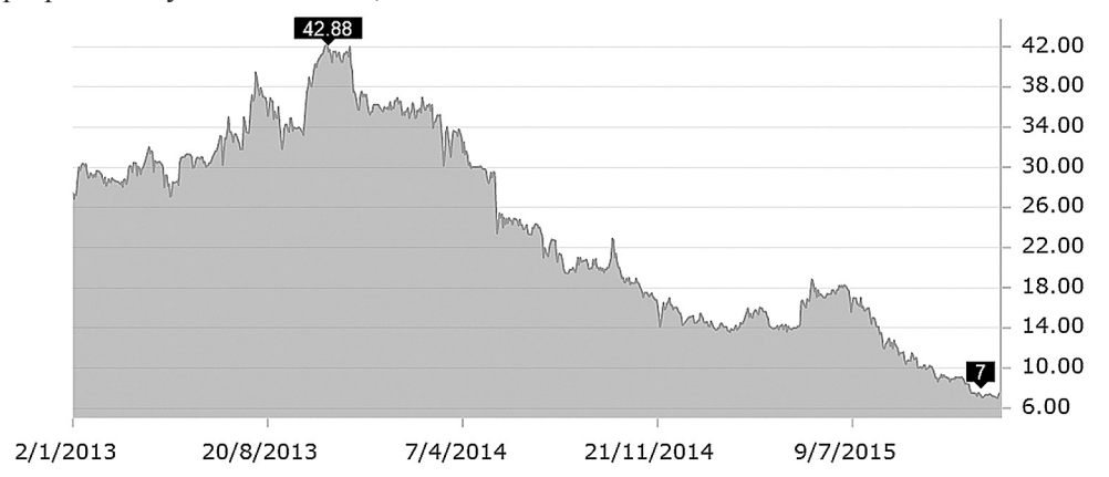
Chart 2. The share value of Alma Market S.A. on the Warsaw Stock Exchange between 2nd January 2013 and 31st December 2015

wait with congratulations (Warren Buffett). The Du Pont model comes as one of the most popular methods applied to provide an enormous increase in the ratio of net profitability of equity (funds) capital. Understanding the ROE as a result of the combination of three elements (ROS, AT, EM), it is possible to evaluate its changes in relation with the change in the financing structure, productivity of assets and sales profitability. Hence, the changes in the value of the particular factors are not the only interesting elements – the relations which appear among them are thought-provoking as well. To provide proper evaluation, the selected methods of causal analysis (the subsequent replacement method) have been applied, defining the scope which refers to the influence of changes exerted by the particular ratios on the change in the synthetic ROE ratio