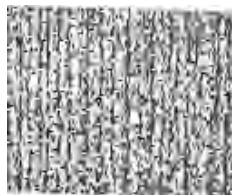
1 100 - ; ) :