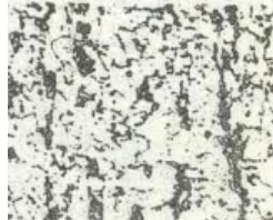
2 500 - ; )/4 ; ) :