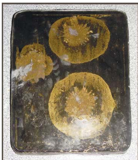
Armoured disk with elastic antirebounding covering

The reorganization of the structure of the Interior and the improvement of the training of specialists are not the only factors that influence the effectiveness of measures to reform the Interior Ministry. The optimization of office and the number of police officers demand higher general level of professionalism. This, in addition to organizational factors is still achieved by the equipping the units with modern equipment and weapons.