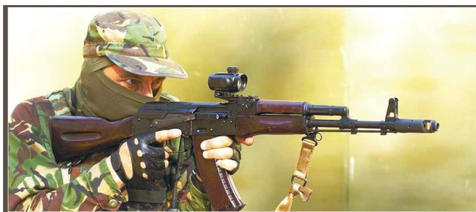
Sight set in AK-74 with Transitional Mechanical Arrangement

To protect the employees of special units of the National Police (cords) and the National Guard during special operations several samples of domestic booletproof targets with improved technical and economic characteristics are implemented in production.