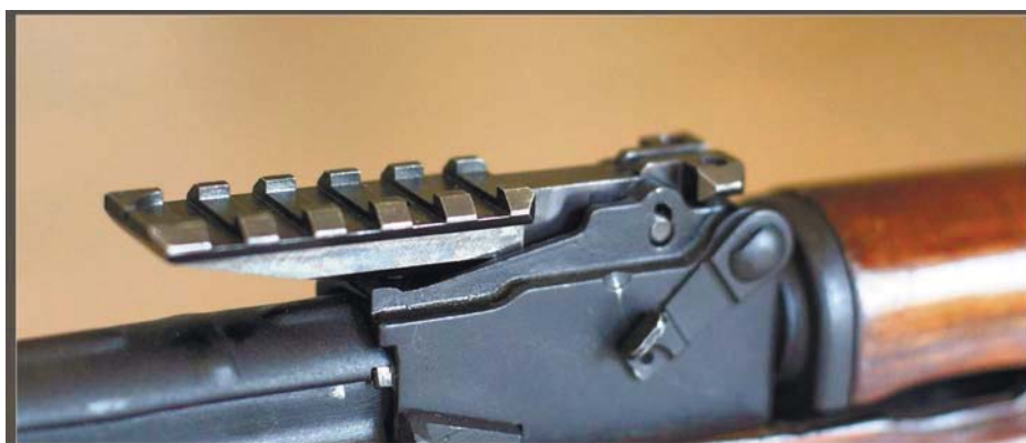
Transitional Mechanical Arrangement with Slat of Viver

For the purpose of an efficient modernization of put into service samples of small arms several adaptations are developed that allow them to install a variety of equipment mounting on Weaver and Pikatini brackets including thermal sights and night vision [1, p 180].