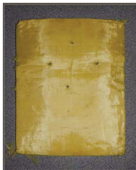
Armoured disk with kevlar antirebounding covering

For the purpose of an efficient modernization of put into service samples of small arms several adaptations are developed that allow them to install a variety of equipment mounting on Weaver and Pikatini brackets including thermal sights and night vision [1, p 180].