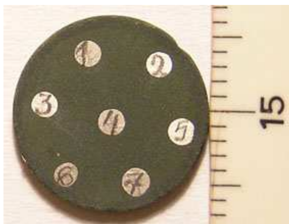
Figure 1 – Bitmap of varistor ceramics specimen

Such value of the absolute error is close to the absolute error of length measurement by means of the micrometer \pm 10 \mu m and three times lower than the absolute error of length measurement for the vernier calipers \pm 100 \mu m. It should be noted that micrometer and vernier calipers do not allow measuring the sizes of planar objects precisely (electrodes in the Fig. 1). Bitmaps give the possibility to determine sizes of planar objects by the method described above. Thus, for example, the electrode 2 in Fig. 1 has the sizes along x and y axis d_x = 1,75 \pm 0,03 mm, d_y = 1,72 \pm 0,03 mm, correspondingly. The electrode area calculated by the formula of ellipse area is equal 2,36 \pm 0,06 mm 2 . The relative error of sizes determination is \pm 1,7 % and the relative error of area determination is \pm 2,5 % for electrodes in the Fig. 1.