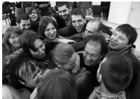
Photo 7. Consolidation (After the spectacle; Donets’k, February 16, 2014)