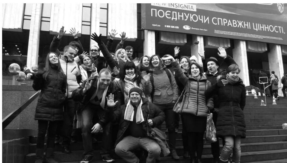
Photo 1. The International Theatre of the Oppressed Organisation (ITO). Kyiv, February 16, 2014. Inscription on the pediment of the building: “Combining True Values”.

loaded with problems that seemed to have neither immediate nor far-reaching solutions, which was typical of a society in the state of “emergency”.