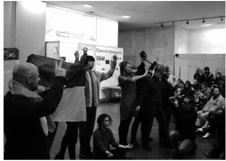
Photo 3. An ideal image of Ukraine ("The Three Pieces about Maidan"; Kyiv, February 16, 2014)