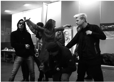
Photo 2. The current image of Ukraine ("The Three Pieces about Maidan"; Kyiv, February 16, 2014)

"Despite being torn apart by different opinions and actions, Ukraine keeps its balance and, moreover, speaks with confidence" (Olena, 29 years old).