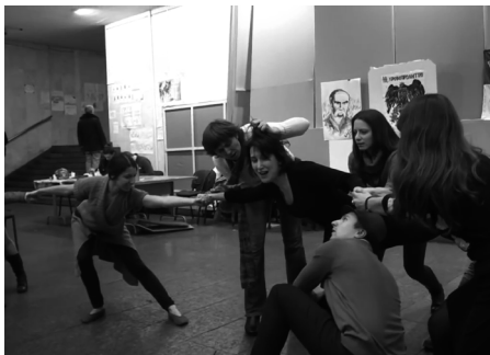
Photo 6. Confused identity (“The Birthday”; Kyiv, February 16, 2014)